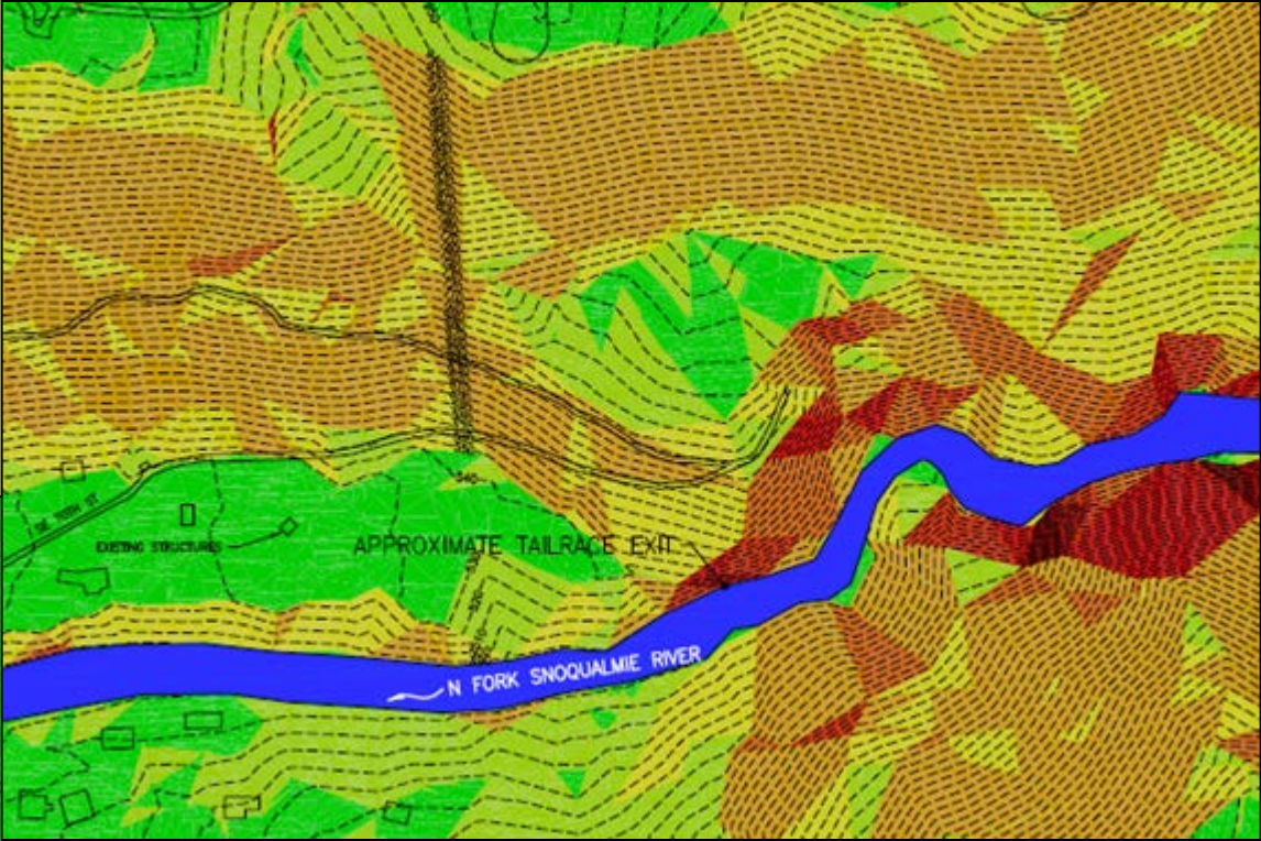
Tailrace Exit (above)